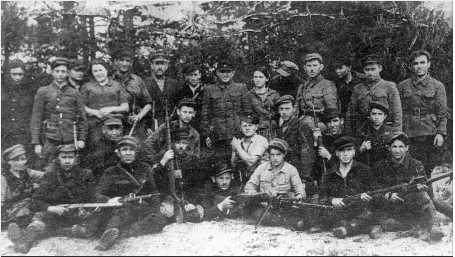
Part of the Bleiski unit towards the end of the War. Approximate date 1943-1944.