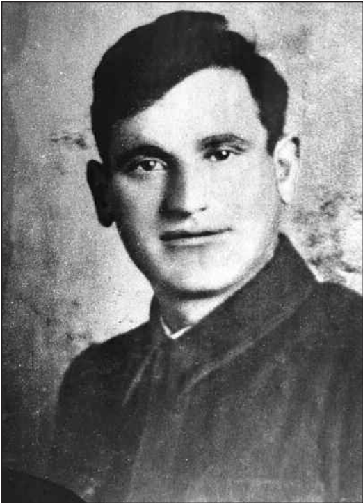
Asael Bielski was killed during the battle of Koenigsberg in 1944 while fighting in the Red Army. Approximate date 1943-1944.

With the arrival of the cold weather, characteristic of the Belarus winter, the brothers, worried about the prospect of their people freezing to death, ordered the construction of large wooden living quarters, known as zemplankas in Russian. Built partially into the ground, the structures utilized earthen walls to contain as much heat as possible. The dank, dark spaces were far from luxurious, but they kept the large group protected from the bitter Belorussian winter. "It also helped if we had a little vodka," remembered one survivor.