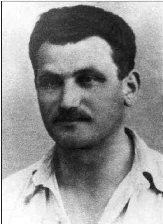
Tuvia Bielski. Date unknown.